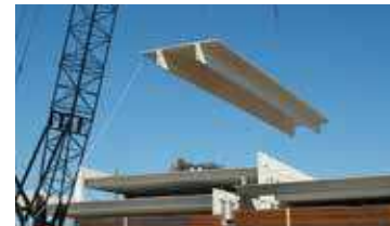
Prefabricated / Modular