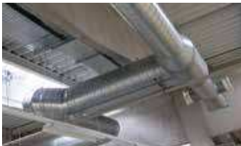
Mechanical / Plumbing