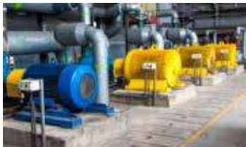
Plant / Equipment Installation